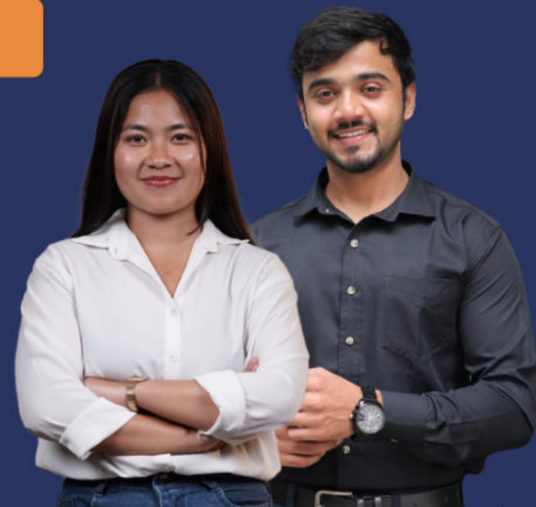
PMIS interns from top companies

Age 18 to 25 years * Not be in full-time employment